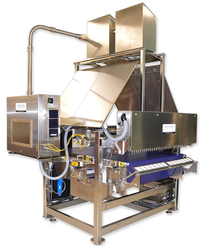
MT-50 In-line Inspection Systems for Rice Cakes