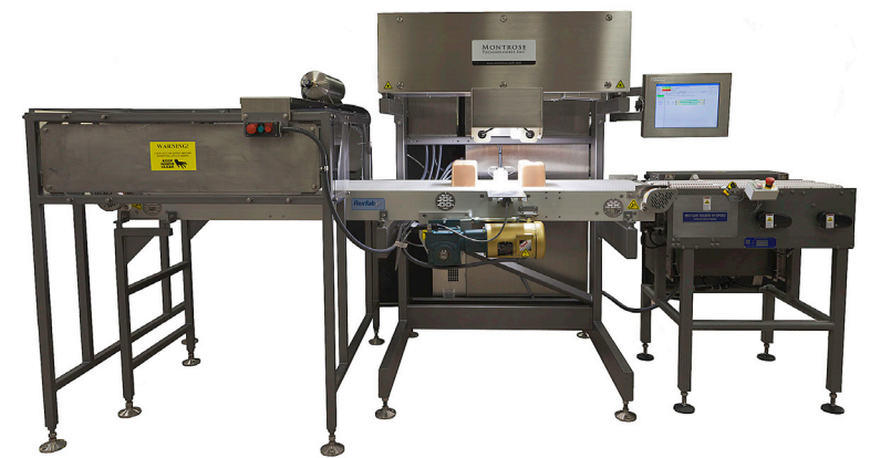
MT-18 Loaf Inspection System