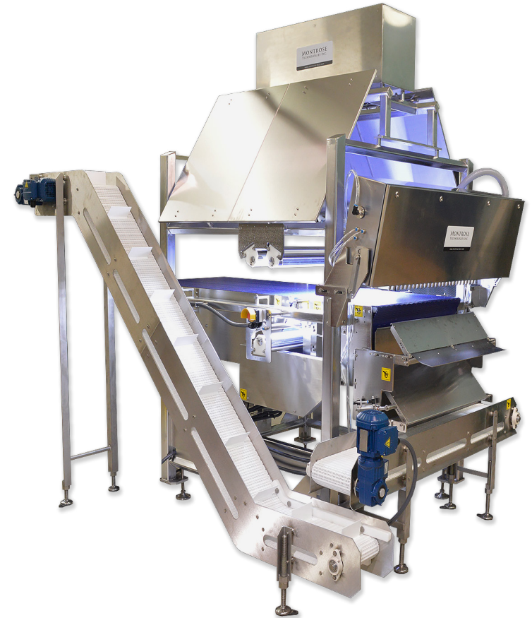
MT-36 In-line Inspection Systems for Bagels