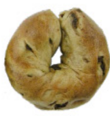
Poor Join (Sloped and/or side notched)