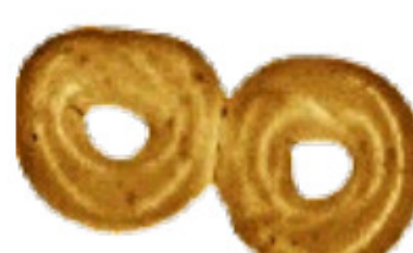
Kissed (join length and double surface area, separate and re-circulate)