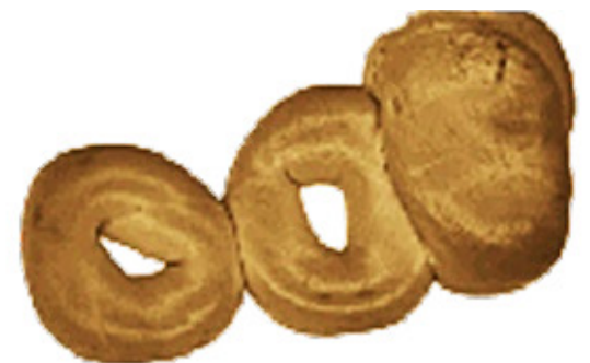
Double Triple (large surface area and hole count)

Only common examples have been pictured. There are many standard measurements that can be used, individually or combined within formulae, to qualify your product. All visible product characteristics and faults can be quantified.