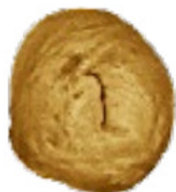
Too Large (large peak height, and/or volume)